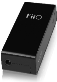
E3 Headphone Amplifier

Guangzhou FiiO Electronic Technology Ltd